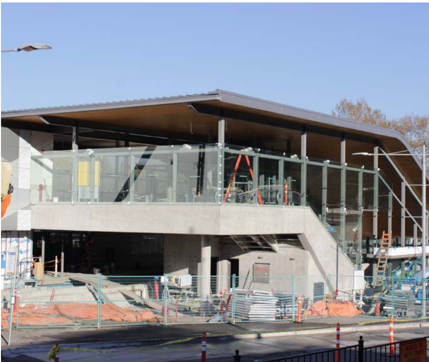
Moody Centre Station

The Evergreen Line project is an 11-kilometre extension to the existing SkyTrain system in Metro Vancouver. It will be a fast, frequent and convenient SkyTrain service, connecting Coquitlam City Centre through Port Moody to Lougheed Town Centre in approximately 15 minutes. It will connect without transfer to the current SkyTrain network at Lougheed Town Centre Station and will integrate with regional bus and West Coast Express networks. When the line opens, Metro Vancouver's SkyTrain system will become the longest fully automated rapid transit system in the world.